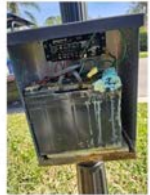
A battery that clearly shows corrosion, making an obvious case for a different solution.

A prototype has been ordered which will be installed along the Boulevard just south of Benchmark so the community can see the overall look and the difference in lighting. It should arrive mid August. It will look like the photo to the right— notice there is no battery box: it's incorporated under the solar panel! The Landscape/Grounds committee hopes that the Board will be prepared to make a decision on the proposal during the August Board meeting. It's possible we may have improved, totally green, solar lights that require no maintenance for years to come by year's end!