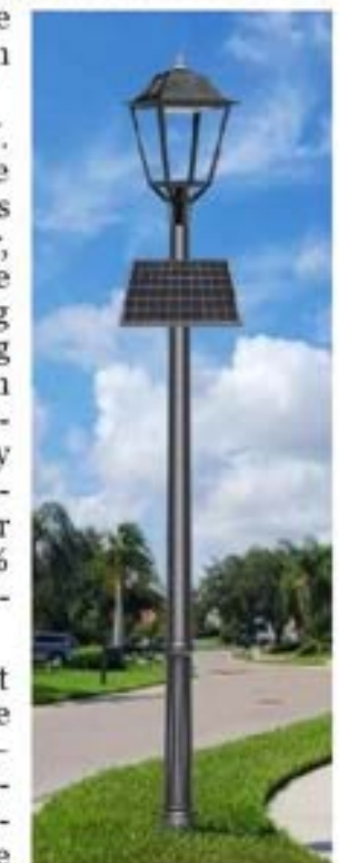
A rendering of the prototype ordered

from 2008: https://www.heraldtribune.com/story/news/2007/08/08/subdivision-lightens-up-on-its-use-of-power/28566967007/ ), there is a better solution to our