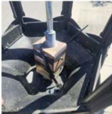
This shows the bottom of a fixture where the bulb socket was rigged to stay in place (and upright) using a brick. While inventive, it's far from ideal.

Many residents over the last few years have complained about the street lights throughout Turtle Rock: they are too dull, and many are in a dilapidated state of repair. This is understandable, as the fixtures are over 30 years old, and were converted from natural gas to solar 15 years ago. The lighting fixtures themselves on top of the pole are wearing out – some are listing badly, others are missing their finials and other parts, most are corroded... as seen from some issues shown here. Maintaining them costs us between $3K to $8K annually for